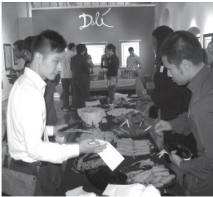
Our Summer Reception and Awards Ceremony was in an art gallery with a Salvador Dali exhibit! June 2009